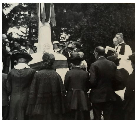
the inauguration of the village War Memorial in 1921