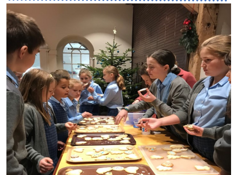
Year 8 manning the stall at a bake sale for Turning Tides