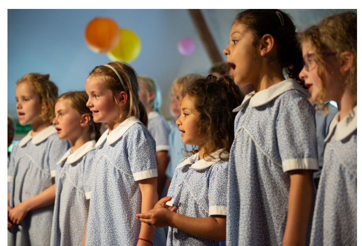
'Pupils are kind, happy, well-behaved and confident'. (ISI Report, September 2018) Dorset House was given the top 'Excellent' rating in all areas.