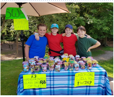
Year 7 girls set up a stall at Sports Day selling hand-painted jars of sweets for FEAST